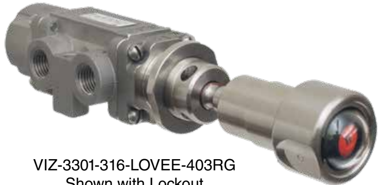
VIZ-3301-316-LOVEE-403RG Shown with Lockout

The valve is available with Versa's lockout options. By applying a lockout option a pneumatic system can be locked out for maintenance or shut down.